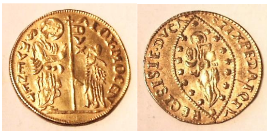
Venetian Gold Ducat of Alvise Mocenigo IV, 1763-1778

Although not minted by the VOC, the two most common gold trade coins used by the VOC in Ceylon were the Venetian Ducat and the Dutch Ducat. A beautiful example of each of these coins is shown below.