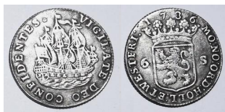
Silver 6 Stuiver 1736 Hollandia