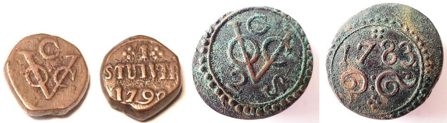
VOC (Colombo) 1 Stuiver Dump 1792

On the obverse of the dump is the large VOC emblem with the letter mark of the mint above while on the reverse is the date. The value can be on the obverse or the reverse and can be written in full or abbreviated. Three examples are shown below.