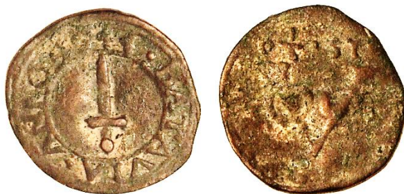
VOC "Conjok" Batavia ½ Stuiver

The coins have on the obverse a Sword with the words ANNO 1644 BATAVIA in the legend, and on the reverse the VOC device with the words "½ St". Putting this date into historical context it was also the period of the start of the English Civil War and the Civil War Battle of Lostwithiel was fought on August 21 st 1644 at the same moment in history as this coin had its very brief period of currency.