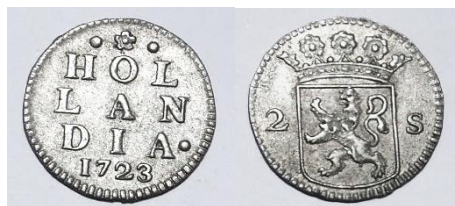
2 Stuivers Hollandia 1723