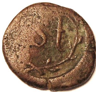
Wreath Series 1 Stuiver

In 1660 the VOC started minting anonymous undated “dump” style 2, 1, ½ and ¼ stuiver copper coins bearing their value within a wreath on the obverse and the reverse. These were minted until 1720 and are grouped into three wreath types, depending on whether they were minted at Jaffna, Negapatnam or Colombo. An example of the Colombo 1 stuiver and also of the Jaffna ¼ stuiver are shown.