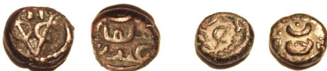
VOC 2 Kas Pulicat Dump