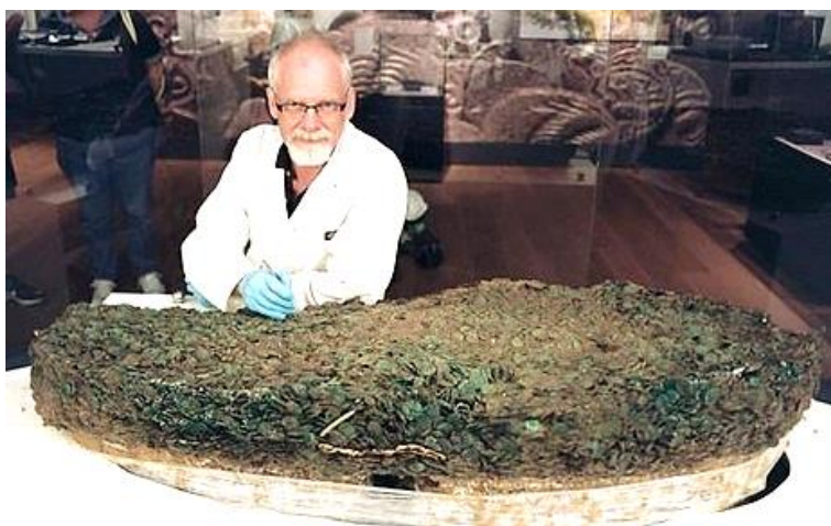
The hoard at the Jersey Museum

In May 2012 they detected a strong, deep response and began digging. At a depth of about a metre they exposed the top of what seemed to be a substantial mass of coins. Acting very responsibly, and with remarkable self-control, they immediately filled in the hole and reported their find to local authorities. Excavation work was taken over by archaeologists from Jersey Heritage who, in June 2012, finished unearthing what turned out to be an extraordinarily large hoard of Celtic coins, probably dating from about 60-50 BC.