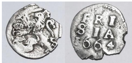
2 Stuivers Frisia 1664