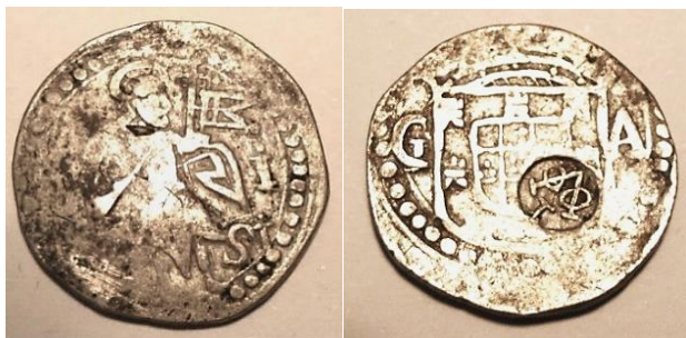
Portuguese St John 2 Tanga with Jaffna VOC/I counterstamp

Prior to 1660 the VOC authorised the use of the existing Portuguese colonial coins counter stamped at Galle, Colombo and Jaffna with the VOC and certain other counterstamps. Shown below is an example of a Portuguese 2 Tanga piece with the VOC counterstamp for Jaffna.