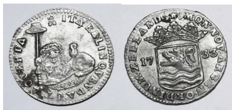
Silver 6 Stuiver 1733 Zeeland

In addition, 6 stuiver silver coins from the Netherlands were also in use. Two examples are shown below. The earliest of these is a 1733 piece from Zeeland with crowned arms of Zeeland on the obverse and on the reverse a lion couchant supporting a hat on a lance with a castle mintmark above. The second 6 stuiver piece is dated 1736 from the province of Holland. It shows a man of war in full sail on the obverse, with the arms of Holland separating the value 6 S and the date above on the reverse.