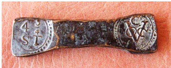
Reproduction VOC 4 \frac{3}{4} Stuiver Copper Bar of 1785

The bars only had a short tenure and most were melted down to make the more convenient normal copper dumps. Genuine bars are therefore extremely rare and nearly all examples seen today, including the one in my collection, shown below, are probably reproductions.