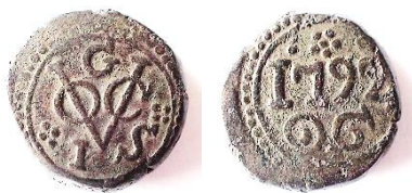
VOC (Galle) 1 Stuiver Dump 1792