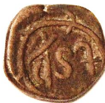
Wreath Series ¼ Stuiver