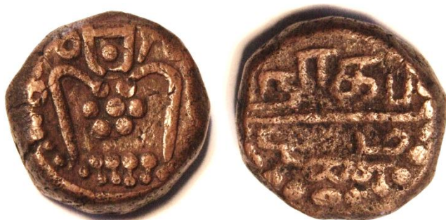
Negapatnam Kali 50 Cash Dump