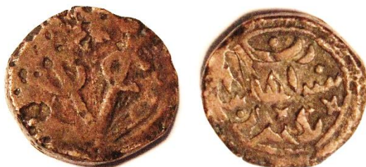
VOC 10 Kas Pulicat Dump

Examples of the Pulicat coinage used in Ceylon are shown below.