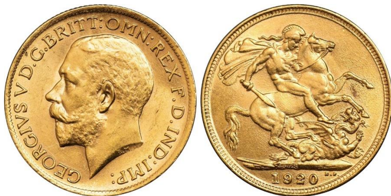
George V, sovereign, 1920S,

The following are selected extracts from the catalogue for St. James's Auctions, Auction 25 (Lot 5), conducted in London on 5 March 2014.