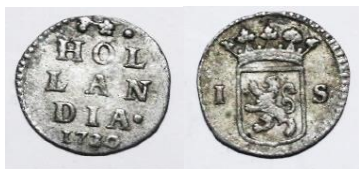
1 Stuiver Hollandia 1730

In addition, 6 stuiver silver coins from the Netherlands were also in use. Two examples are shown below. The earliest of these is a 1733 piece from Zeeland with crowned arms of Zeeland on the obverse and on the reverse a lion couchant supporting a hat on a lance with a castle mintmark above. The second 6 stuiver piece is dated 1736 from the province of Holland. It shows a man of war in full sail on the obverse, with the arms of Holland separating the value 6 S and the date above on the reverse.