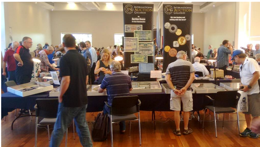
General View, Main Room

Saturday 10 th – Sunday 11 th March 2018