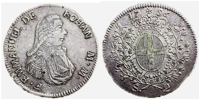
2 Scudi, Knights of Malta, 1796

My two coins were both issued in 1796 by Grand Master Emmanuel de Rohan. They are a silver two scudi (12 Tari) piece and a silver one scudo (6 Tari) piece, both in excellent condition.