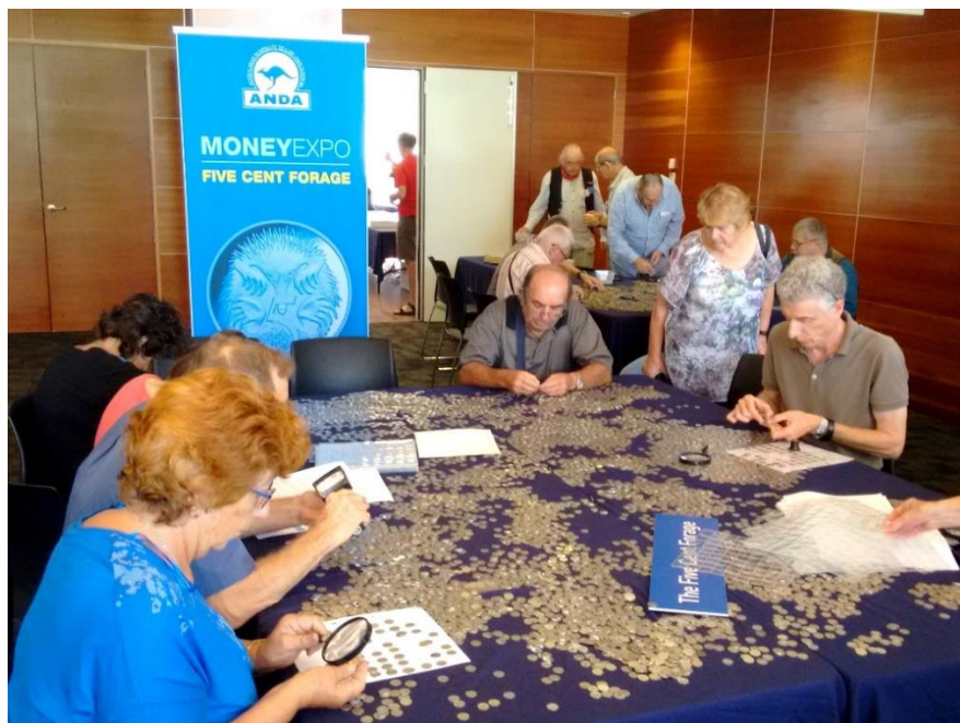
Five Cent Forage