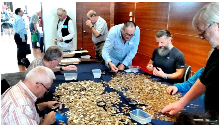
Foreign Coin Forage