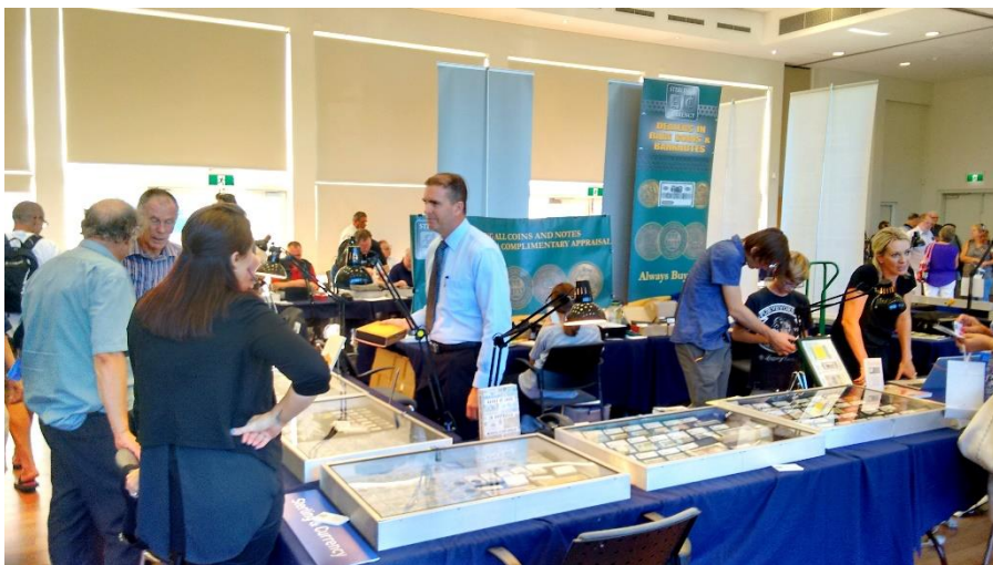
General View, Main Room