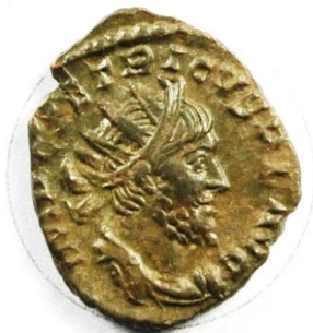
Antoninianus of Tetricus I, AD 272-273, ex Braithwell Hoard

Of course, we don't have buried hoards of ancient coins here in Western Australia, but we do have something broadly comparable in the form of coins recovered from the seabed from the predominantly Dutch ships that were wrecked along our coast in the 17 th and 18 th Centuries. These include previously unknown coins struck at the Middelburg mint in Zeeland, Holland, in 1711. The entire mintages of these were consigned to Batavia (Jakarta) on the Dutch East Indies Company ship the Zuytdorp, which was wrecked on the coast north of Geraldton before that year was out.