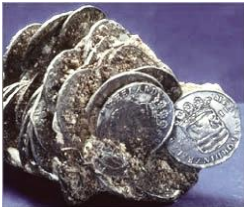
Cemented Mass of Coins from the Wreck of the Zuytdorp

Examples of shipwreck coins can only be legally owned if they are accompanied by a sale permit and certificate from the West Australian Museum, which provide wonderful provenance, leading directly back to 17 th or 18 th Century Holland.