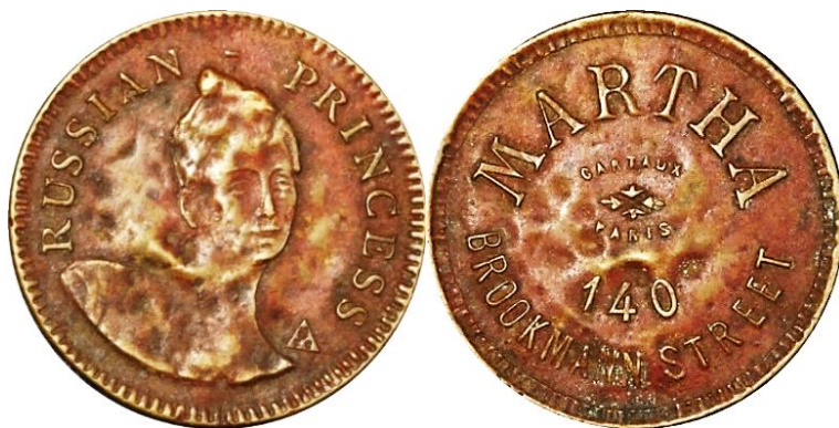
Kalgoorlie Brothel Token Circa 1900

'What I've been led to believe is that they used to give them to the local barber shop, the guys used to go in and have haircuts, shaves, whatever, buy their tobacco, and then they'd buy a token. They'd buy the token and then that night they'd go down to the working girl, hand the working girl the token, she would give her services. The next day they would get up and they would go downtown and they'd give it back to the barber and he would give them their cut'.