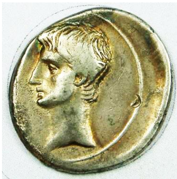
The Roman Emperor Augustus

This makes it quite clear that Augustus sought out and collected unusual coins.