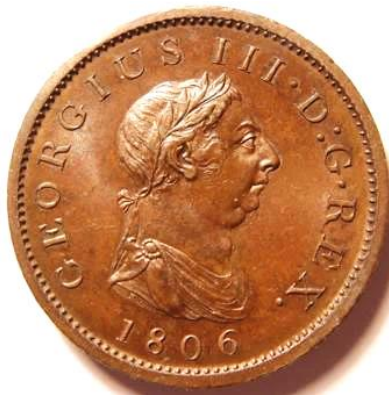
King George III

Image sources: http://www.icollector.com/ & http://www.coins-of-the-uk.co.uk