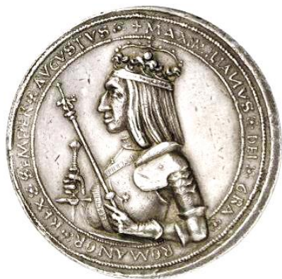
Maximilian I, Holy Roman Emperor