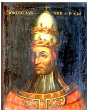
Pope Boniface VIII

We have no record of any other individual collectors until the early years of the Renaissance, when coins (particularly ancient coins) became an interest for small numbers of wealthy and often aristocratic men in Europe, including kings and popes. Pope Boniface VIII (1230-1303) was the earliest of several popes we know to have collected coins and Pope Paul II (1417-1471) is said to have amassed over a thousand ancient coins.