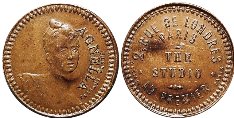
Paris Brothel Token Circa 1900

Generic designs were not entirely unheard of, as demonstrated by this Cartaux token for a Parisian bordello or ' Maison Close ' (closed house) on which ' Agnella ' bears a startling resemblance to the ' Russian Princess '.