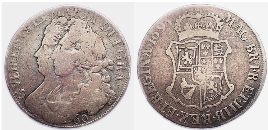
William & Mary, Sixty Shillings, 1691

The only two English coins of this reign matched in value and weight by an actual single Scottish coin were the English crown of 5 shillings and the halfpenny. The English crown was matched by the Scottish 60 shilling piece of William and Mary, which is the coin shown here.